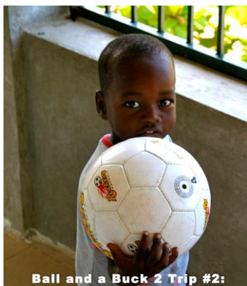
Ball and a Buck 2 Trip #2:

Your club donated over 200 soccer balls and those balls have already made it to Haiti, Peru, Afghanistan and Iraq!